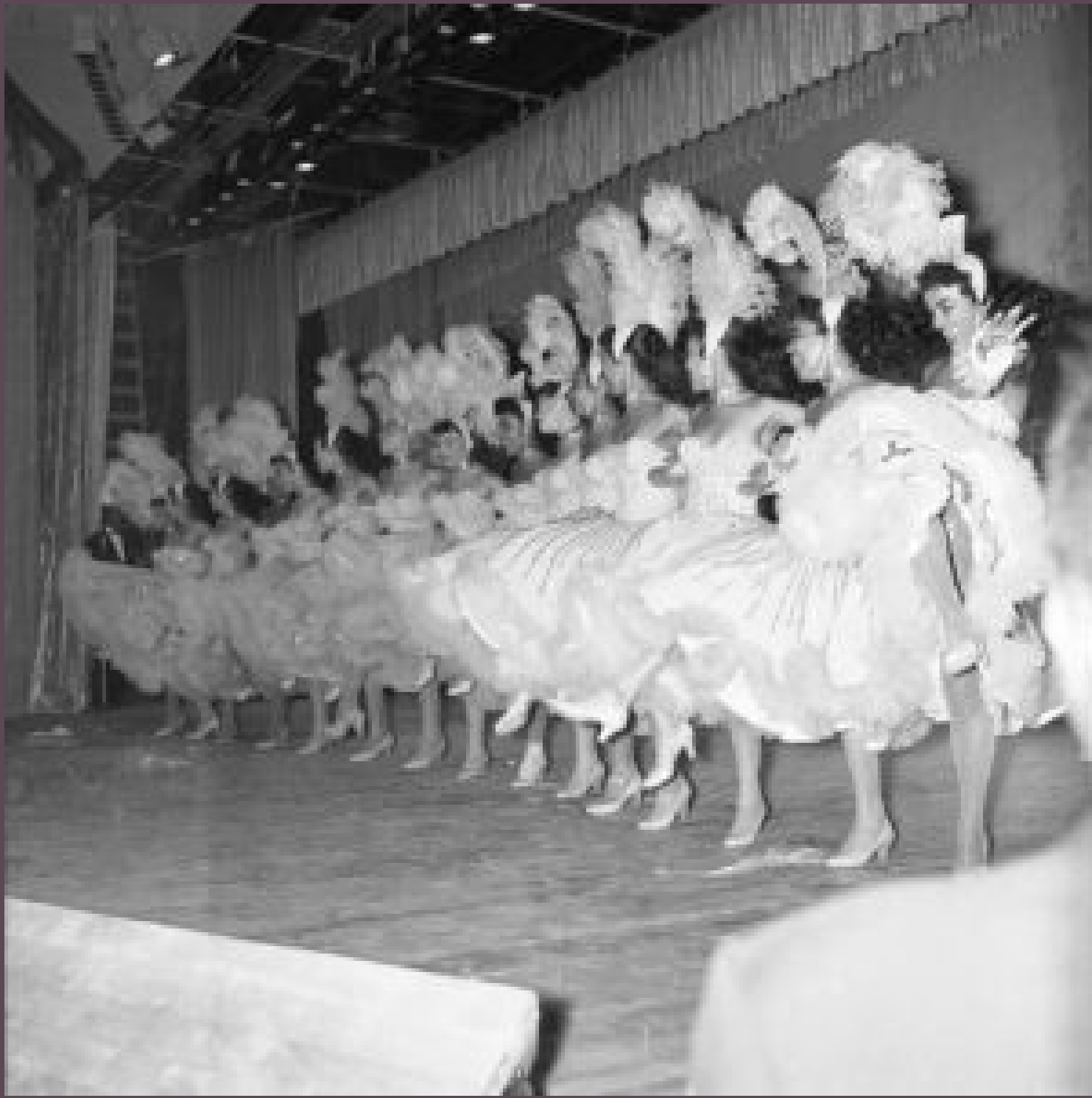
Dancers at the Moulin Rouge