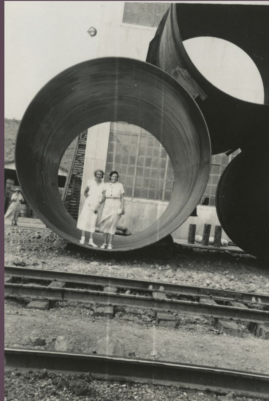
Two women posing at the Babcock & Wilcox steel fabrication plant.