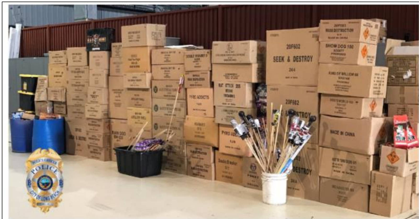
Long Beach police confiscated over 5,000 pounds of illegal fireworks along with illegal firearms on Friday, Dec. 11, 2020.