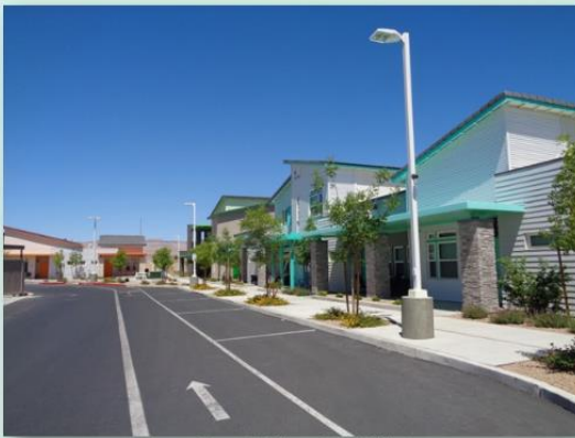
Opportunity Village – Betty's Village

U.S. Department of Housing and Urban Development