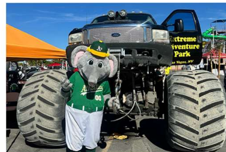
Mighty Motor Mania

November was all about community and gratitude. From local celebrations to give back events, we enjoyed every moment spent with the people who make Southern Nevada so special. Here's a look back!