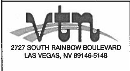
EXHIBIT TO ACCOMPANY LEGAL DESCRIPTION RIGHT-OF-WAY DEDICATION