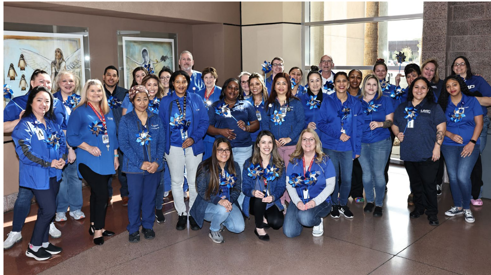
UMC Hospital Staff