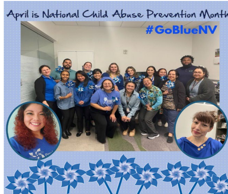
Go Blue Day!