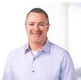
Jeff Clarke Chief Operating Officer and Vice Chairman, Dell Technologies